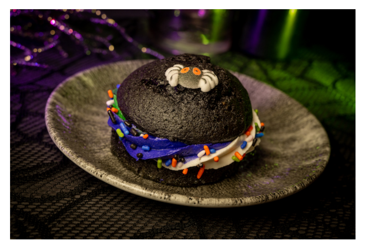
Liberty Square Market (Available Aug. 11 through Nov. 1 during regular park hours and Mickey's Not-So-Scary Halloween Party)

• Black Velvet Whoopie Pie: Black velvet cookie with buttercream and sprinkles topped with a sugar spider (New)