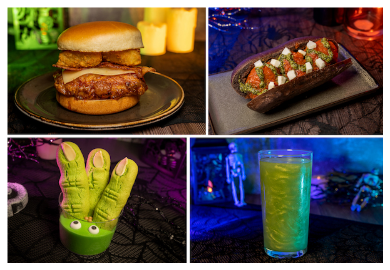
Cosmic Ray's Starlight Café (Available Aug. 11 through Nov. 1 during Mickey's Not-So-Scary Halloween Party only)

through Nov. 1 during regular park hours and Mickey's Not-So-Scary Halloween Party)