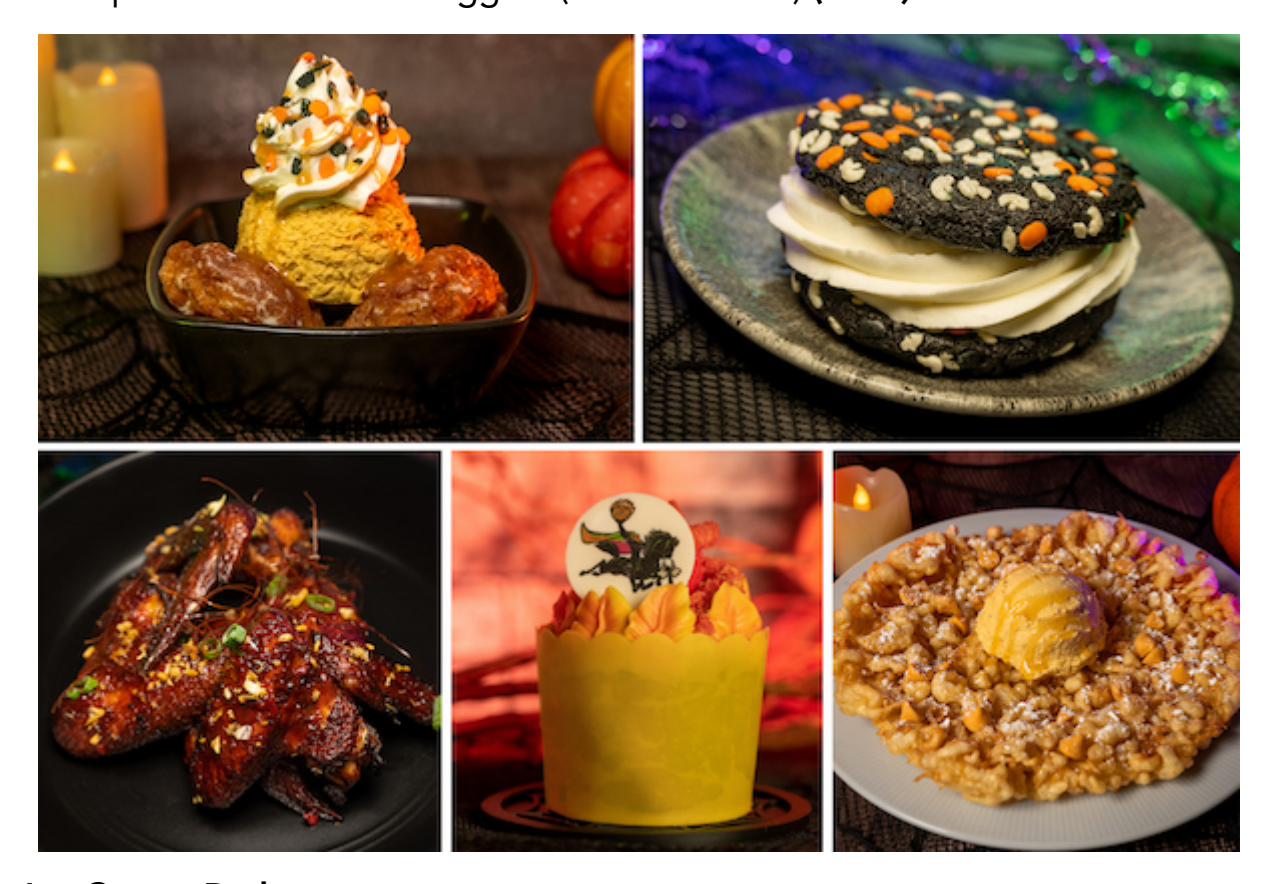
Plaza Ice Cream Parlor