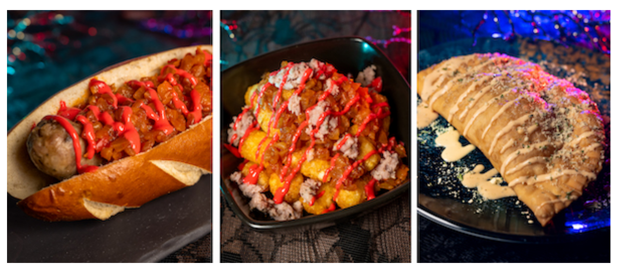
The Friar's Nook (Available Aug. 11 through Nov. 1 during Mickey's Not-So-Scary Halloween Party only)