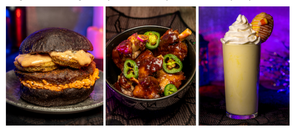
Pecos Bill Tall Tale Inn & Café (Available Aug. 11 through Nov. 1 during Mickey's Not-So-Scary Halloween Party only)